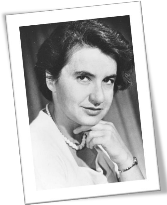
• Rosalind Franklin, 1920 – 1958.

The discussion of Rosalind Franklin's life and work often rotates around one impossible question: had she not died of ovarian cancer at the age of thirty-seven, would she have shared the 1962 Nobel Prize for Physiology or Medicine with James Watson and Francis Crick? The answer is probably not.